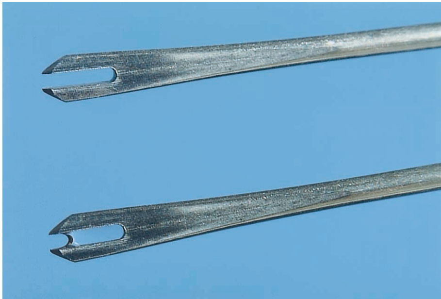
Figure 1. Bifurcated needle for smallpox vaccination. A needle is shown both empty and containing vaccine in the bifurcation.

artery-related disease occurring within 1 month after vaccination appear to be only temporally related to vaccination, rather than being caused by the vaccine itself. The CDC has cautiously recommended that individuals at increased risk of cardiac disease be granted medical deferrals for smallpox vaccination.