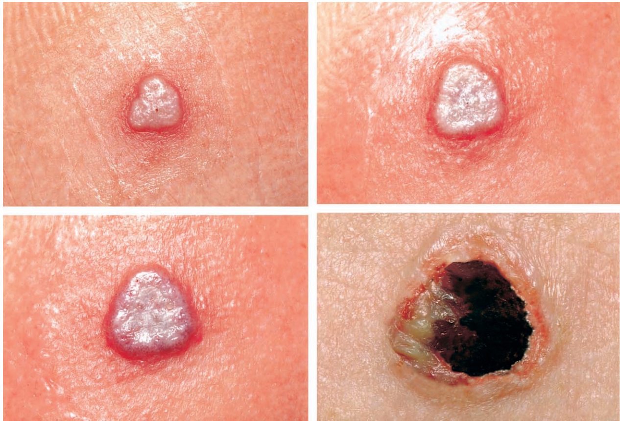
Figure 3. Progression of primary vaccination. Upper left , Lesion at day 5 after vaccination; upper right , day 8; lower left , day 10; lower right , day 14.

campaign, almost all were vaccinated with no skin preparation. In the past, some vaccinators used acetone to clean the skin (the acetone should be given time to evaporate before vaccination); others have used soap and water. Under no circumstances should alcohol be applied to the skin before vaccination. Skin preparation with alcohol may result in fewer takes, because residual amounts of alcohol on the skin inactivate the vaccine virus.