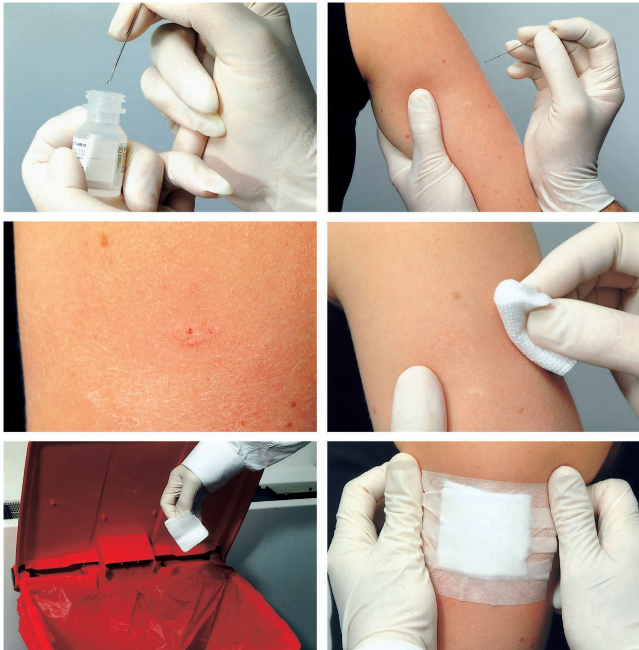
Figure 2. The correct sequence for smallpox vaccination. Upper left , Dipping of the needle into a vaccine vial. Upper right , Proper position for 3–15 insertions. Middle left , Appearance of site after successful vaccination. Middle right , Wiping of excess vaccine. Lower left , Safe discarding of gauze. Lower right , Appropriate covering for vaccination site (semipermeable membrane shown) for health care workers. Others need nothing or a loosely applied sterile gauze pad.

Site of vaccination. The preferred site for vaccination is the deltoid area on the upper arm. Traditionally, the vaccination is done on the nondominant arm to avoid limitation of use, should there be a local reaction of sufficient severity. In the past, other sites were sometimes used because of cosmetic concerns. Placement of the vaccination at sites likely to be heated or constrained (such as those under several layers of clothing) may result in maceration and increased local reactions. Place-