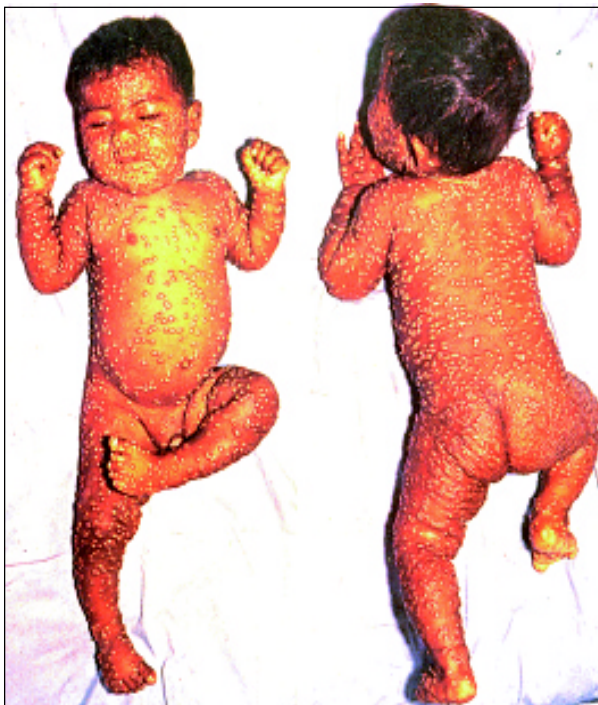
Figure 1. Most cases of smallpox are clinically typical and readily able to be diagnosed. Lesions on each area of the body are at the same stage of development, are deeply embedded in the skin, and are more densely concentrated on the face and extremities.

Smallpox is a viral disease unique to humans. To sustain itself, the virus must pass from person to person in a continuing chain of infection and is spread by inhalation of air droplets or aerosols. Twelve to 14 days after infection, the patient typically becomes febrile and has severe aching pains and prostration. Some 2 to 3 days later, a papular rash develops over the face and spreads to the extremities (Figure 1). The rash soon becomes vesicular and