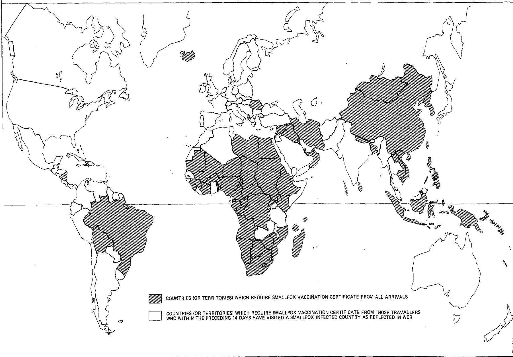
STATUS OF SMALLPOX VACCINATION CERTIFICATE REQUIREMENTS FOR INTERNATIONAL TRAVELLERS, 1978